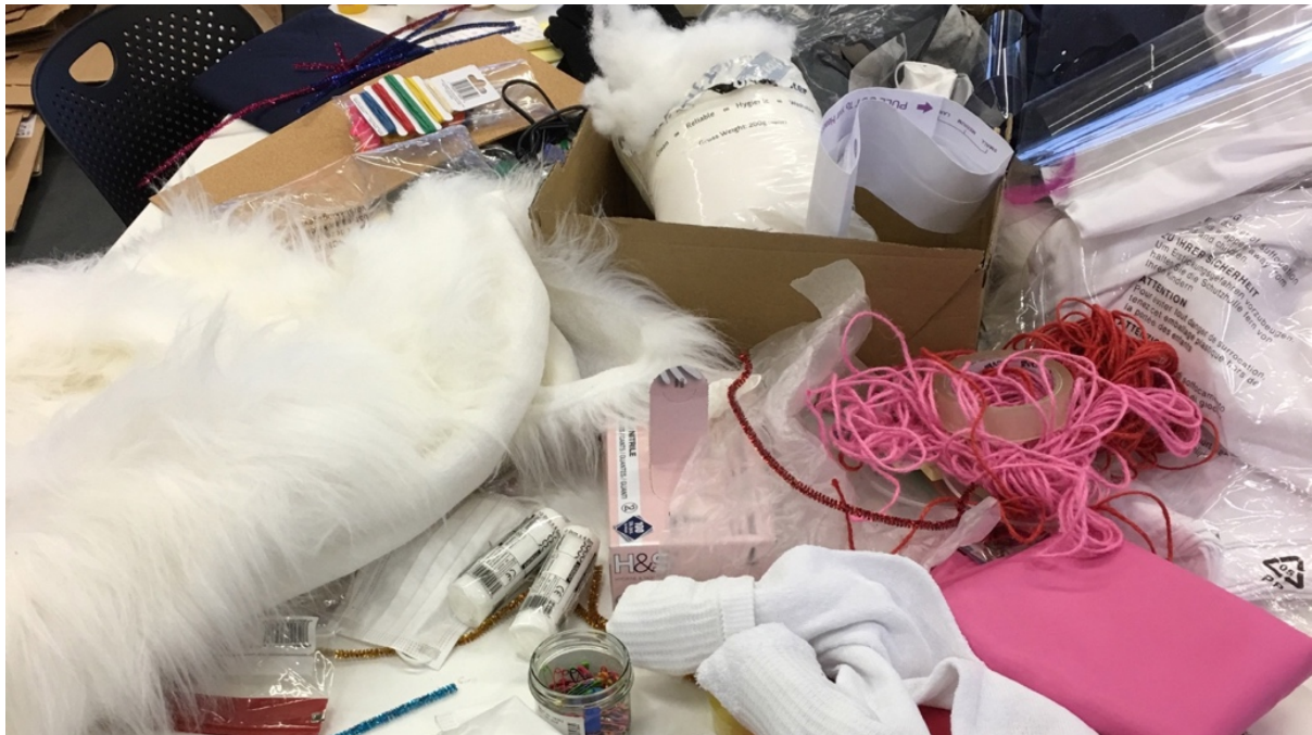
Figure 2. Sensory materials used within the workshop.

The materials were introduced to the ID students in the first of three workshops (see Fig. 2.), designed to support ideation of initial 'sketchy' concepts, before experience prototyping one or more of these concepts using the QPTR process. The premise was that at this divergent and creative stage of the UXD process (the 'Develop' stage of the Double Diamond) exposure to a wide variety of sensory materials would provoke the students to consider a broad range of touch-mediated communication experiences.