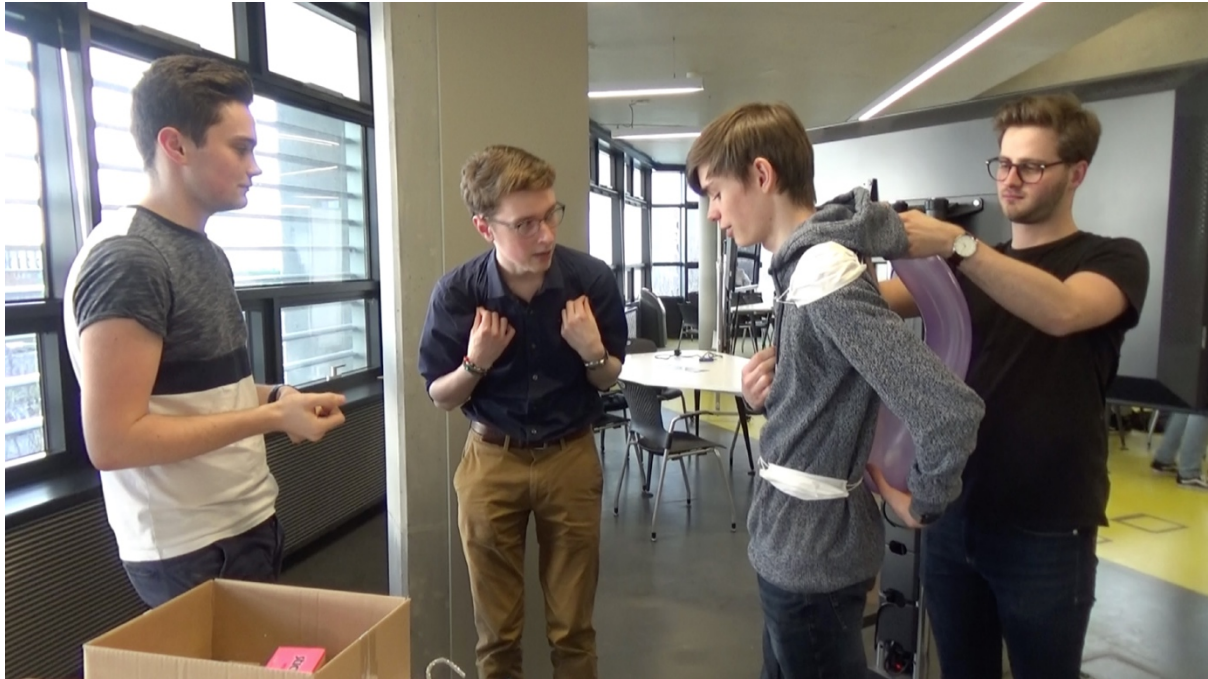
Figure 3. SDCA students experience prototyping.