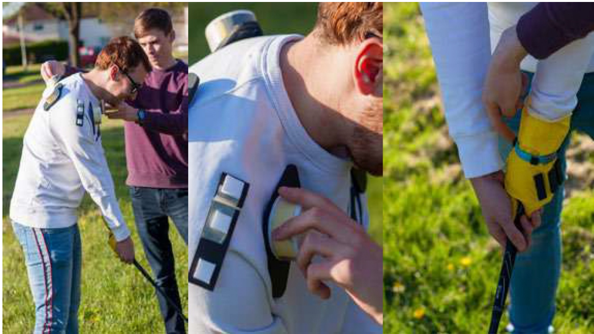
Figure 5. Later experience prototyping of iterated touch technology concept in context with a user.