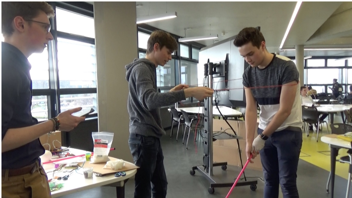
Figure 4. Exploring the role of digital touch within a golfing context.

Experiments with different forms of digital touch are apparent (a surgical glove is being used as a prop to signify a smart glove that senses the golfer's grip on the club; string and a balloon are being experimented with to explore how pressure on the back and/or shoulders could be used to direct the golfer into the correct posture as part of a shirt-based wearable). Although the nature of the sensations conveyed was discussed and negotiated amongst the student designers, this was 'broad brushed' typically at the level of 'inputs' and 'outputs'